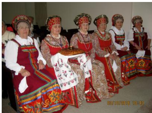
Veterans Home - Khabarovsk

with warm hospitality, gratifying smiles and a lovely lunch!