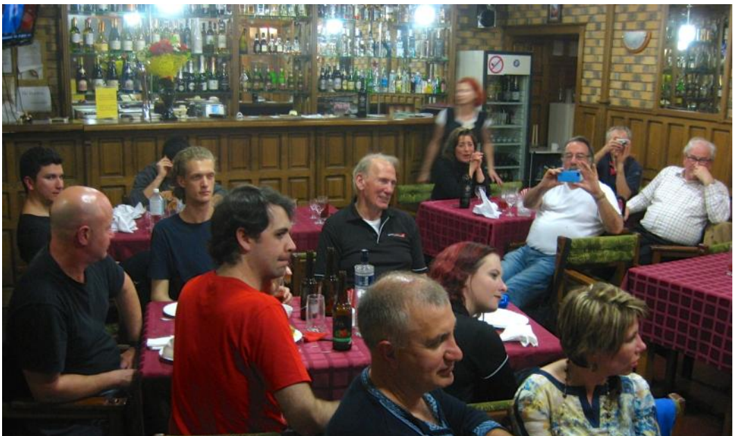
Relaxing after a concert