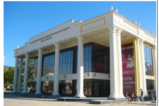
The Chekhov Theatre - Yuzhno-Sakhalinsk

Indeed one of our more memorable concerts was in the 'Chekhov Theatre', in the island's capital city, Yuzhno-Sakhalinsk where our reputation had preceded us. "We knew you were