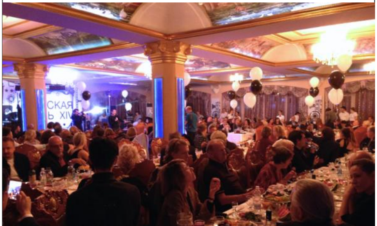
The PANORAMA RESTAURANT, Blagoveshchensk

So it was quite a feather in our cap to be invited to perform there. The official closure of the "Amur Autumn" award presentations was followed by a sumptuous, Hollywood style dinner hosted by the City