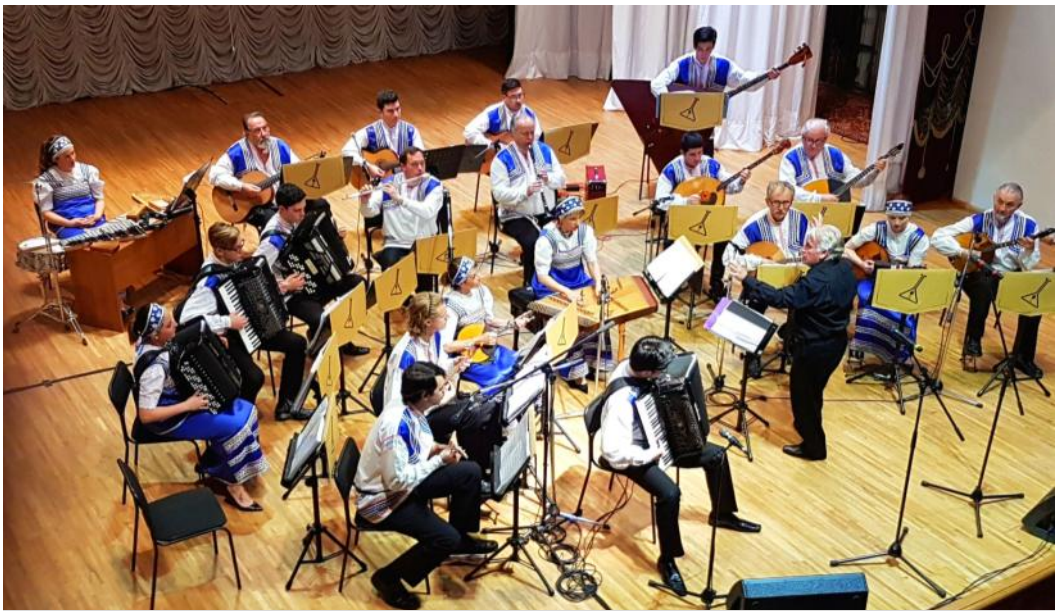
In performance - Khabarovsk