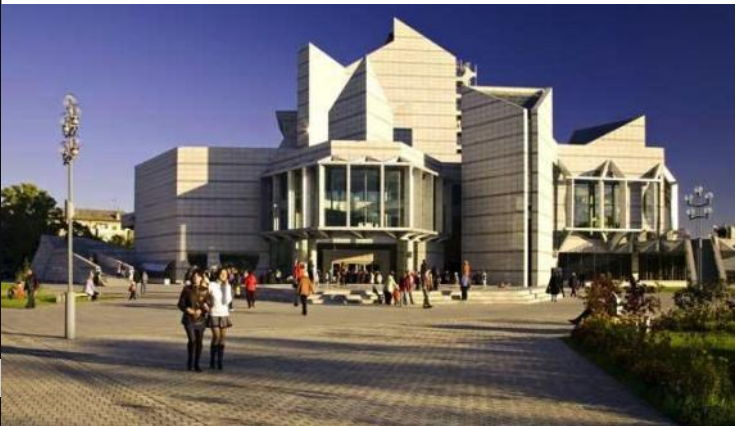
Community Cultural Centre - Blagoveshchensk

Every year since 2002, the city of Blagoveshchensk hosts "Amur Autumn", an Open Russian Cinema & Theatre Festival, which brings many of Russia's actors, artists & film stars together in this remote corner of the Russian far east.